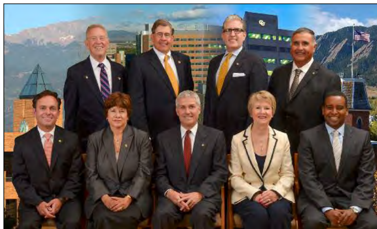
2013-14 University of Colorado Board of Regents (back row, from left): Steve Bosley, James E. Geddes, Stephen Ludwig, Glen Gallegos; (front row, from left): Kyle Hybl, Irene Griego, Michael Carrigan, Sue Sharkey, Joseph Neguse.