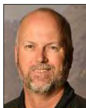
Bart Emery Coors Events Center